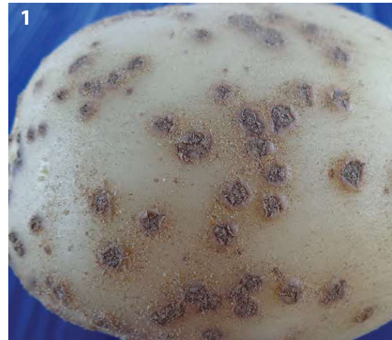
The common powdery scab symptoms.

"These galls result from the proliferation of host cells, which is induced by Spongospora . This occurs on stolons and tubers, but also on roots. The creamy-white galls later develop into brown masses of Spongospora sporosori , with each of the proliferated host cells being filled with a single sporosorus , which in itself contains many resting spores (50 to 1 500+).